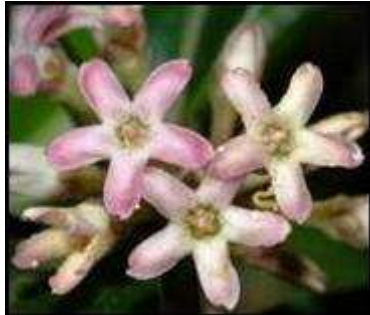
Marsdenia suaveolens